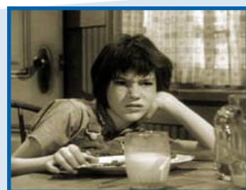
Visit with Academy Award nominee Mary Badham on April 14, at 2:00 p.m.

What better way to come together than by taking part in The Big Read: One Book/One Community program, sponsored by The Big Read, the East Baton Rouge Parish Library, and the Baton Rouge Area Chamber (BRAC). So far, The Big Read: One Book/One Community program has brought together nine parishes with movie showings, presentations by authors, oral history, documentaries, book discussions, and even more planned through May.